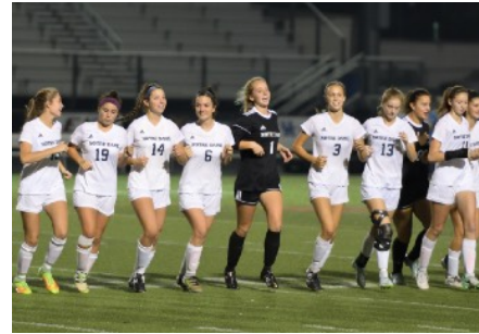
DIARY OF A PANDA'S LAST NDA SOCCER GAME. 2