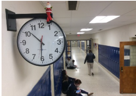
Around NDA: Santa knows when you're awake, and at 10:30 a.m. on a December morning, from his perch atop a clock, he saw a hall lined with Pandas.