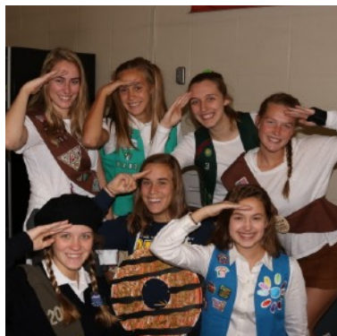
Halloween: Here's a salute to the seniors' choice of Girl Scout-themed costumes.